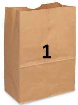
Outer clothing Shoes