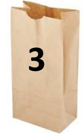
Jewellery Wallet Money